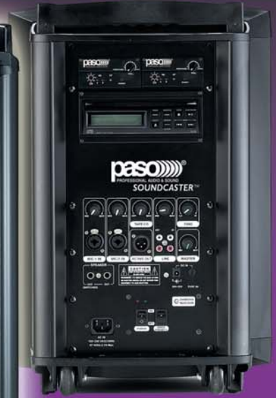
WPSS100CD REAR (SHOWN WITH TWO RM170U RECEIVER MODULES)