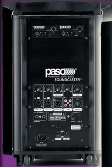
WPSS100 REAR (SHOWN WITH TWO RM170U RECEIVER MODULES)

Model WPSS100CD - Complete System with CD Player and Handheld Transmitter